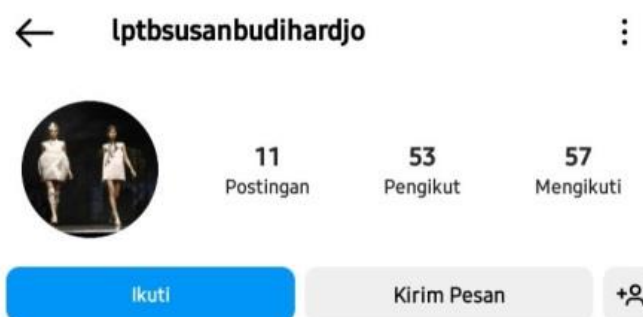
Figure 5. Instagram Account of @lptbususanbudihardjo

The caption on figure 4 above means that the celebgram is introducing the @lptbususanbudihardjo endorsement product. The field of meaning related to women's fashion in this photo caption is "Salatiga Fashion Food Festival 2017; Wardrobe; @lptbususanbudihardjo_official @lptbususanbudihardjo; Credits; @de_sastroo @muji_yono_b; #salatiga; #catwalk; #modeling; #fashionmodel; #salatigacarnival; #salatigafashionfoodfestival". Furthermore, the meaning field is wardrobe; catwalk.