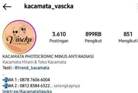
Figure 11. Instagram Account of @kacamata_vascka

The caption on figure 10 above means that the celebgram is introducing the @kacamata_vascka endorsement product. The field of meaning related to women's accessories in this photo caption is " frame ini casual; semua bentuk muka; dikasih lensa photobrown ". Furthermore, the meaning field is frame; casual; bentuk muka; lensa; photobrown .