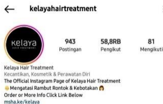
Figure 9. Instagram account of @kelayahairtreatment

The caption on figure 8 above means that the celebgram is introducing the @kelayahairtreatment endorsement product. The field of meaning related to women's beauty in this photo caption is "Diserbu pertanyaan haircare teros; pake shampoo spesial minyak kemiri dan aloe vera" . Furthermore, the meaning field is haircare; shampoo; minyak kemiri; aloe vera.