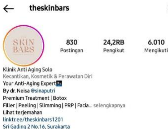
Figure 7. Instagram Account of @theskinbars