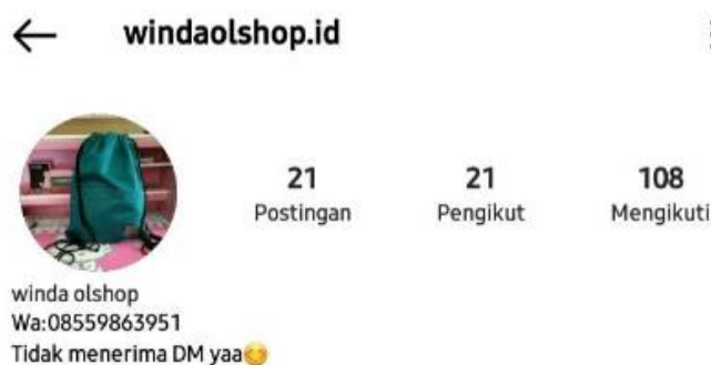
Figure 3. Instagram Account of @windaolshop.id