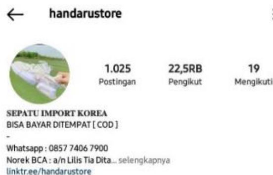
Figure 13. Instagram Account of @handarustore

The caption on figure 10 above means that the celebgram is introducing the @handarustore endorsement product. The field of meaning related to women's accessories in this photo caption is " sepatu lebaran?; Sepatu fashion korea import; seratus ribuan; dijamin awet! ". Furthermore, the meaning field is sepatu; import; seratus ribuan; awet .